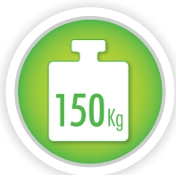
CAPACITY 150 kg

Medel Crystal is also equipped with an easy-to-read LCD display and a convenient automatic switching off. Batteries are included.