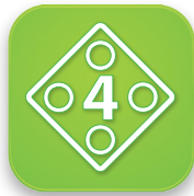
4 high-precision sensors