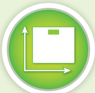
Size 30 x 30 cm