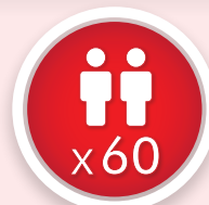
2 Users with 60 memory spaces