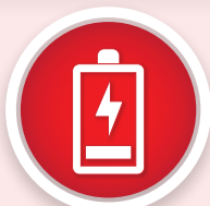
Low battery indicator

EUROPEAN SOCIETY OF HYPERTENSION APPROVAL