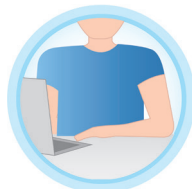
data transfer to PC and smartphone