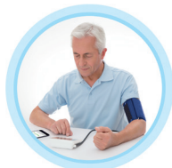
Blood pressure monitor