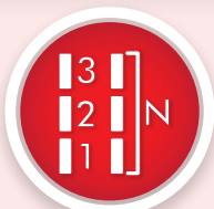
Classification of measurements